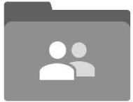
SPORTS & GAM...