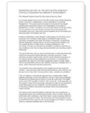
RHAS PhD Stud...