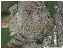
shapshap map (d...