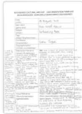
Katie @ FSA.pdf