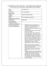
FILM SCHOOL A...